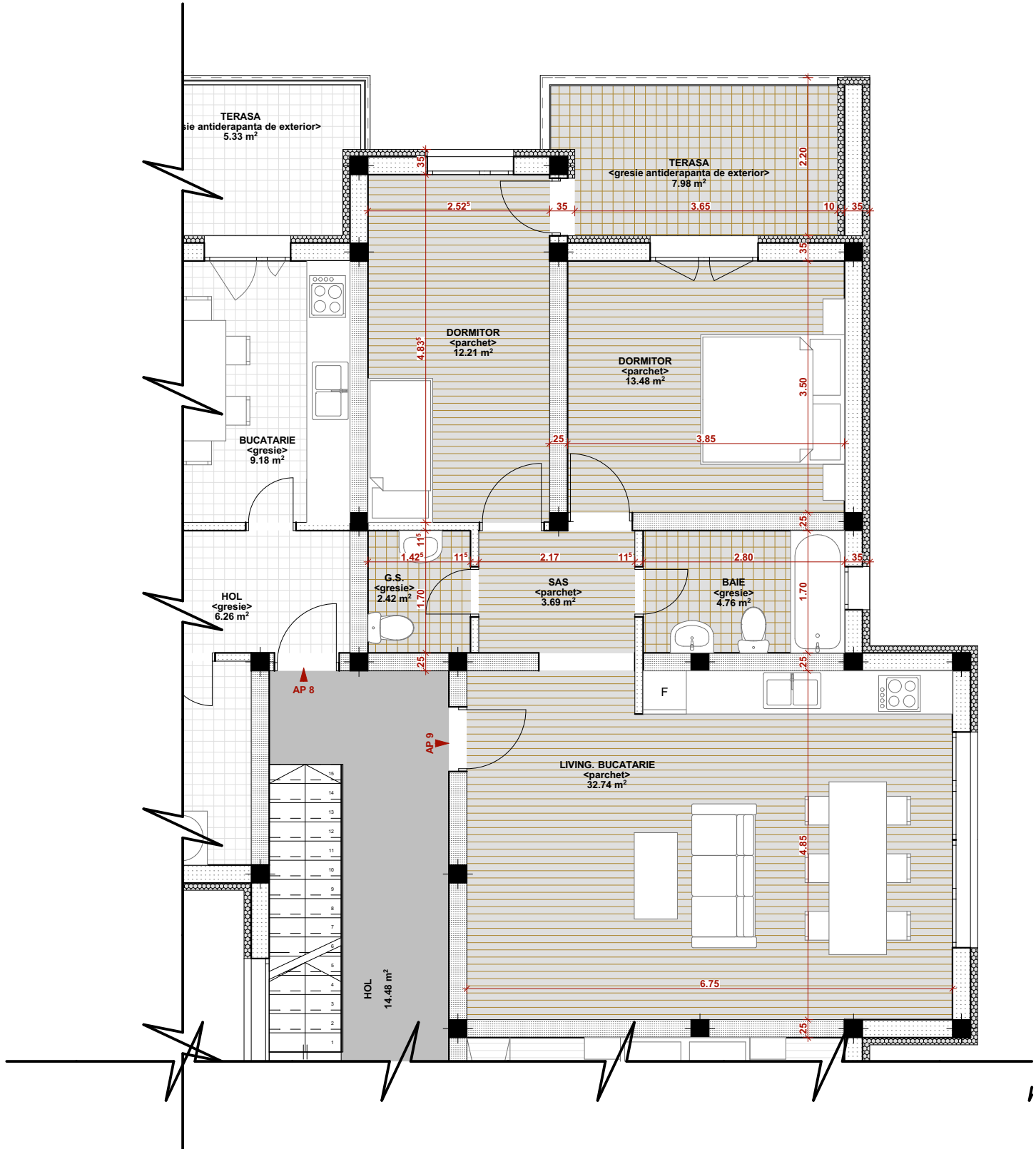
PLAN ETAJ 2. APARTAMENT 9 - Suprafata utila 69.30 mp, Suprafata terasa 7.98 mp